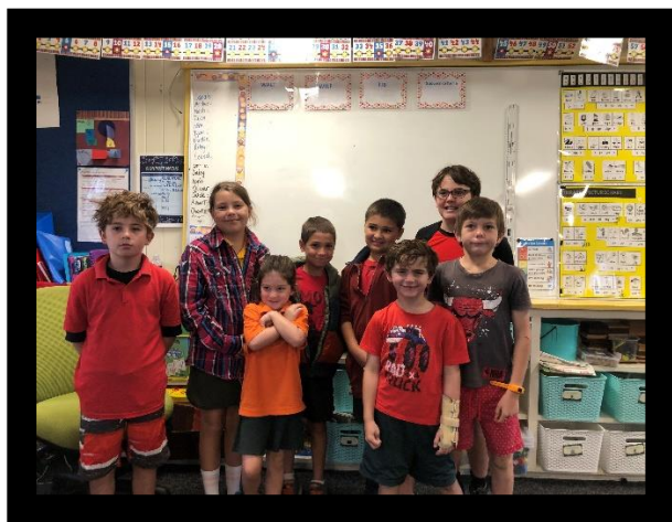
Students wearing “red” for Day for Daniel.

2 November - Holiday 5 November - Swimming 8 November - Transition to Kindy Day One (9:00 to 1:15 pm) 11 November - Remembrance Day 12 November - Swimming 15 November - Transition from Kindy to Prep Day One (all day) 17 November - Transition to Kindy Day Two (9:00 to 1:15 pm) 19 November - Possible catch up day for swimming 25 November - Playgroup at Muttaborra State School 26 November - Transition from Kindy to Prep Day Two (all day) 29 November - Swimming Carnival at Aramac SS for students in year 1 to year 6 30 November - Awards night at the Muttaborra Hall 2 December - Student report cards mailed home 3 December - Last day of school and party day.